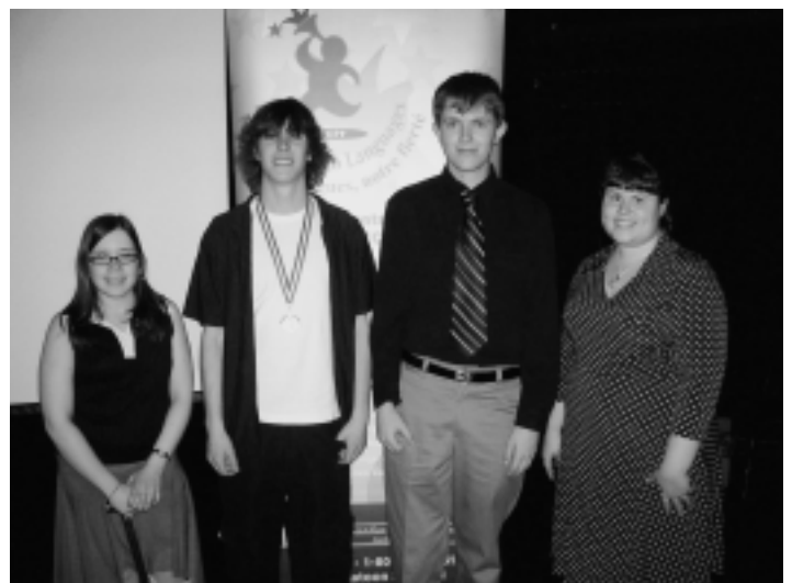
Grade 11-12 winners at the Saskatchewan Provincial Final of Concours d'art oratoire